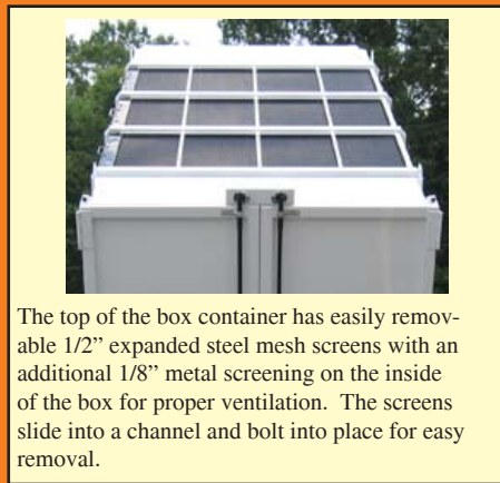
The top of the box container has easily removable 1/2" expanded steel mesh screens with an additional 1/8" metal screening on the inside of the box for proper ventilation. The screens slide into a channel and bolt into place for easy removal.