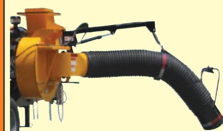
Hydraulic hose boom is standard and maneuvering the the hose is almost effortless because the hose is raised and lowered hydraulically and swivels side to side on flange bearings.

Manufactured by: ODB COMPANY 5118 Glen Alden Drive Richmond, VA 23231 www.leafcollector.com 800-446-9823