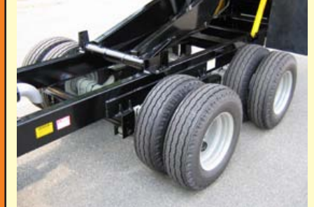
All SCL800™'s come with dual axle configurations for better turning radiuses.